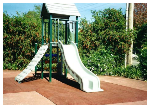
Regupol<sup>®</sup> Reducer Edging

Dimensional Tolerances: Length/Width \pm 1\% Thickness \pm 2~\text{mm}