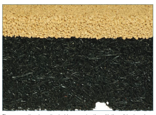
The cross section shows the dual-layer construction with the solid-coloured \ensuremath{\mathsf{EPDM}} layer.

Dimensional Tolerances: Length/Width \pm 1\% Thickness \pm 2~\text{mm}