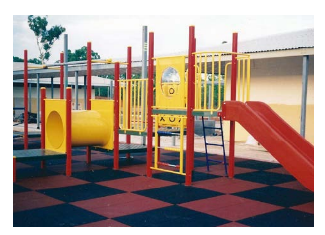
Our \textbf{Regupol}^{\circledast} Safety and Elastic Tiles are fitted with drainage grooves at the underside as standard.

The cross section shows the dual-layer construction.